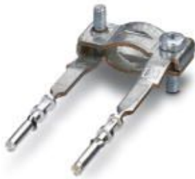
Shield connection for one shielded cable on female contact carriers, without loose crimp contacts

Please be informed that the data shown in this PDF Document is generated from our Online Catalog. Please find the complete data in the user's documentation. Our General Terms of Use for Downloads are valid ( http://phoenixcontact.com/download )