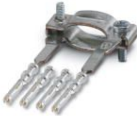
Shield connection for two shielded cables on female contact carriers, without loose crimp contacts

Please be informed that the data shown in this PDF Document is generated from our Online Catalog. Please find the complete data in the user's documentation. Our General Terms of Use for Downloads are valid ( http://phoenixcontact.com/download )