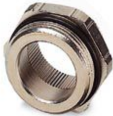
Cable glands for Pg21 half screw connection to Pg21 housing entry, metal

Please be informed that the data shown in this PDF Document is generated from our Online Catalog. Please find the complete data in the user's documentation. Our General Terms of Use for Downloads are valid ( http://phoenixcontact.com/download )