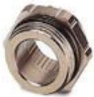
Cable screw connection support Pg16/M25, metal; for thread M25 and rubber seals of size Pg16

Cable gland - VC-M-KV-PG16/M25 ST - 1644407