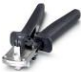
Crimping pliers for turned fiber optics contacts CK1,6-ED...POF

Crimping pliers - CRIMPFOX-1,6-ED-POF-N - 1584839