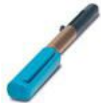
Contact removal tool, for turned and rolled CK- 1.6-... contacts

Contact removal tool - VC-EW 1,6 - 1884869