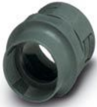
Corrugated tube screw connection, for flexible single wire entry, for connector housings, size Pg16

Please be informed that the data shown in this PDF Document is generated from our Online Catalog. Please find the complete data in the user's documentation. Our General Terms of Use for Downloads are valid ( http://phoenixcontact.com/download )