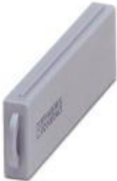
Protective cover, Protective covers, type: VC2, housing material: PA 6, color: gray

Please be informed that the data shown in this PDF Document is generated from our Online Catalog. Please find the complete data in the user's documentation. Our General Terms of Use for Downloads are valid ( http://phoenixcontact.com/download )