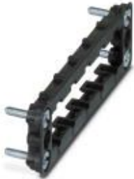
Panel mounting frame, without PE, for contact insert modules, type 4, number of insert modules 5

Please be informed that the data shown in this PDF Document is generated from our Online Catalog. Please find the complete data in the user's documentation. Our General Terms of Use for Downloads are valid ( http://phoenixcontact.com/download )