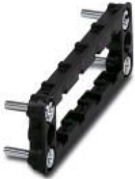
Panel mounting frame, without PE, for contact insert modules, type 3, number of insert modules 4

Please be informed that the data shown in this PDF Document is generated from our Online Catalog. Please find the complete data in the user's documentation. Our General Terms of Use for Downloads are valid ( http://phoenixcontact.com/download )