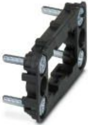
Panel mounting frame, without PE, for contact insert modules, type 1, number of insert modules 2

Please be informed that the data shown in this PDF Document is generated from our Online Catalog. Please find the complete data in the user's documentation. Our General Terms of Use for Downloads are valid ( http://phoenixcontact.com/download )