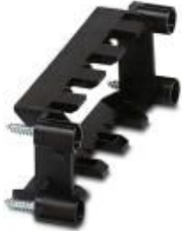
Sleeve frame, without PE, for contact insert modules, type 2, number of insert modules 3

Please be informed that the data shown in this PDF Document is generated from our Online Catalog. Please find the complete data in the user's documentation. Our General Terms of Use for Downloads are valid ( http://phoenixcontact.com/download )