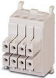
Contact insert module, for sleeve frames, with screw connection, 8-pos., 160 V / 10 A

Please be informed that the data shown in this PDF Document is generated from our Online Catalog. Please find the complete data in the user's documentation. Our General Terms of Use for Downloads are valid ( http://phoenixcontact.com/download )