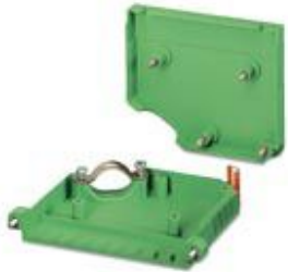
Cable housing, pitch: 0 mm, number of positions: 9, dimension a: 70.98 mm, color: green

Please be informed that the data shown in this PDF Document is generated from our Online Catalog. Please find the complete data in the user's documentation. Our General Terms of Use for Downloads are valid ( http://phoenixcontact.com/download )