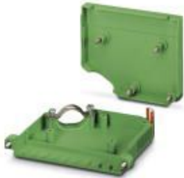
Cable housing, pitch: 0 mm, number of positions: 6, dimension a: 47.52 mm, color: green

Please be informed that the data shown in this PDF Document is generated from our Online Catalog. Please find the complete data in the user's documentation. Our General Terms of Use for Downloads are valid ( http://phoenixcontact.com/download )