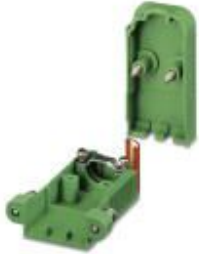
Cable housing, pitch: 0 mm, number of positions: 3, dimension a: 24.66 mm, color: green

Please be informed that the data shown in this PDF Document is generated from our Online Catalog. Please find the complete data in the user's documentation. Our General Terms of Use for Downloads are valid ( http://phoenixcontact.com/download )