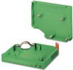
Cable housing, pitch: 0 mm, number of positions: 9, dimension a: 70.38 mm, color: green

Please be informed that the data shown in this PDF Document is generated from our Online Catalog. Please find the complete data in the user's documentation. Our General Terms of Use for Downloads are valid ( http://phoenixcontact.com/download )