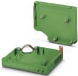
Cable housing, pitch: 0 mm, number of positions: 6, dimension a: 47.52 mm, color: green

Please be informed that the data shown in this PDF Document is generated from our Online Catalog. Please find the complete data in the user's documentation. Our General Terms of Use for Downloads are valid ( http://phoenixcontact.com/download )