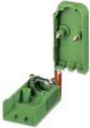
Cable housing, pitch: 0 mm, number of positions: 3, dimension a: 24.66 mm, color: green

Please be informed that the data shown in this PDF Document is generated from our Online Catalog. Please find the complete data in the user's documentation. Our General Terms of Use for Downloads are valid ( http://phoenixcontact.com/download )