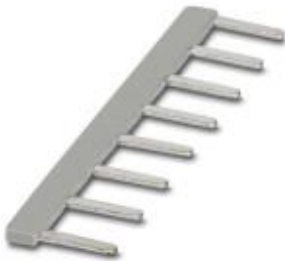
Insertion bridge, number of positions: 8, color: gray

Please be informed that the data shown in this PDF Document is generated from our Online Catalog. Please find the complete data in the user's documentation. Our General Terms of Use for Downloads are valid ( http://phoenixcontact.com/download )