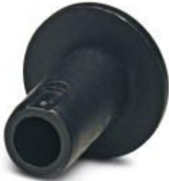
Photovoltaic connector, Range of articles: SUNCLIX, Filler plugs, color: black

Please be informed that the data shown in this PDF Document is generated from our Online Catalog. Please find the complete data in the user's documentation. Our General Terms of Use for Downloads are valid ( http://phoenixcontact.com/download )