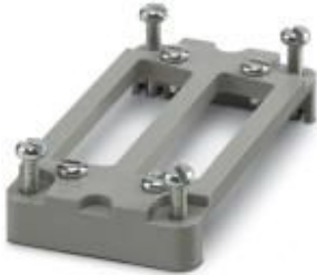
D-SUB adapter plate, for two D-SUB connectors, no. of positions 25, housing series HC-B 10...

Please be informed that the data shown in this PDF Document is generated from our Online Catalog. Please find the complete data in the user's documentation. Our General Terms of Use for Downloads are valid ( http://phoenixcontact.com/download )