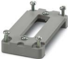
D-SUB adapter plate, for one D-SUB connector, no. of positions 25, housing series HC-B 10...

Please be informed that the data shown in this PDF Document is generated from our Online Catalog. Please find the complete data in the user's documentation. Our General Terms of Use for Downloads are valid ( http://phoenixcontact.com/download )