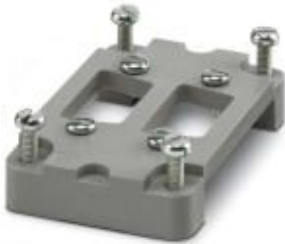
D-SUB adapter plate, for two D-SUB connectors, no. of positions 15, housing series HC-B 6...

Please be informed that the data shown in this PDF Document is generated from our Online Catalog. Please find the complete data in the user's documentation. Our General Terms of Use for Downloads are valid ( http://phoenixcontact.com/download )