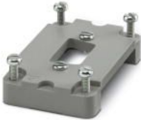
D-SUB adapter plate, for one D-SUB connector, no. of positions 9, housing series HC-B 6...

Please be informed that the data shown in this PDF Document is generated from our Online Catalog. Please find the complete data in the user's documentation. Our General Terms of Use for Downloads are valid ( http://phoenixcontact.com/download )