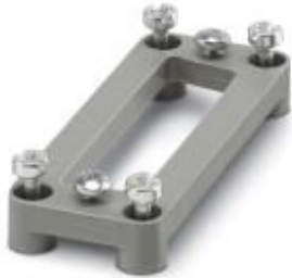
D-SUB adapter plate, for one D-SUB connector, no. of positions 25, housing series HC-D 15...

Please be informed that the data shown in this PDF Document is generated from our Online Catalog. Please find the complete data in the user's documentation. Our General Terms of Use for Downloads are valid ( http://phoenixcontact.com/download )