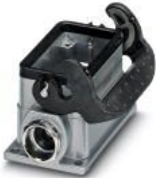
Box mounting base, with single locking latch, height 52 mm, with screw connection, 1x Pg16

Please be informed that the data shown in this PDF Document is generated from our Online Catalog. Please find the complete data in the user's documentation. Our General Terms of Use for Downloads are valid ( http://phoenixcontact.com/download )