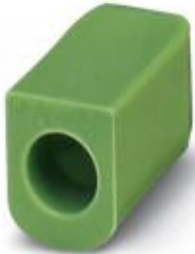
Keying cap, for forming sections, plugs onto header pin, green insulating material

Please be informed that the data shown in this PDF Document is generated from our Online Catalog. Please find the complete data in the user's documentation. Our General Terms of Use for Downloads are valid ( http://phoenixcontact.com/download )