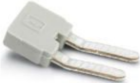
The figure shows the 2-position version

Insertion bridge for connectors with 5.0 mm or 5.08 mm pitch