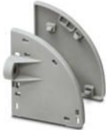
Mounting flange, for mounting directly on the wall

Please be informed that the data shown in this PDF Document is generated from our Online Catalog. Please find the complete data in the user's documentation. Our General Terms of Use for Downloads are valid ( http://phoenixcontact.com/download )