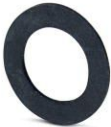
Photovoltaic connector, Seal

Please be informed that the data shown in this PDF Document is generated from our Online Catalog. Please find the complete data in the user's documentation. Our General Terms of Use for Downloads are valid ( http://phoenixcontact.com/download )