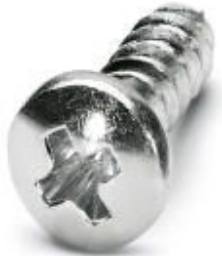
Flange screw for PC 35... connectors

Please be informed that the data shown in this PDF Document is generated from our Online Catalog. Please find the complete data in the user's documentation. Our General Terms of Use for Downloads are valid ( http://phoenixcontact.com/download )