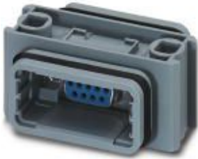
D-SUB coupling, shell size 3, socket, gender changer, shielded, connection direction straight, IP67 degree of protection

Please be informed that the data shown in this PDF Document is generated from our Online Catalog. Please find the complete data in the user's documentation. Our General Terms of Use for Downloads are valid ( http://phoenixcontact.com/download )