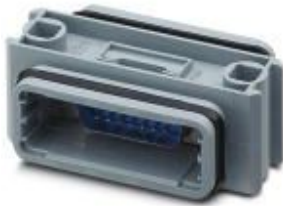
D-SUB coupling, shell size 2, pin, gender changer, shielded, connection direction straight, IP67 degree of protection

Please be informed that the data shown in this PDF Document is generated from our Online Catalog. Please find the complete data in the user's documentation. Our General Terms of Use for Downloads are valid ( http://phoenixcontact.com/download )