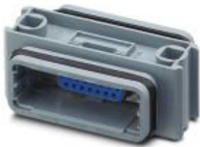
D-SUB coupling, shell size 2, socket, gender changer, shielded, connection direction straight, IP67 degree of protection

Please be informed that the data shown in this PDF Document is generated from our Online Catalog. Please find the complete data in the user's documentation. Our General Terms of Use for Downloads are valid ( http://phoenixcontact.com/download )