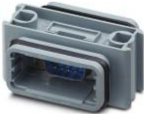
D-SUB coupling, shell size 1, pin, gender changer, shielded, connection direction straight, IP67 degree of protection

Please be informed that the data shown in this PDF Document is generated from our Online Catalog. Please find the complete data in the user's documentation. Our General Terms of Use for Downloads are valid ( http://phoenixcontact.com/download )