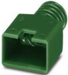
RJ45 bend protection sleeve, for pin insert VS-08-ST-RJ45, cable cross section up to 6 mm, color: green

Please be informed that the data shown in this PDF Document is generated from our Online Catalog. Please find the complete data in the user's documentation. Our General Terms of Use for Downloads are valid ( http://phoenixcontact.com/download )