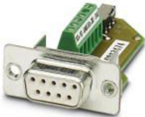
D-SUB CAN-BUS contact insert, type 09, version: Socket

Please be informed that the data shown in this PDF Document is generated from our Online Catalog. Please find the complete data in the user's documentation. Our General Terms of Use for Downloads are valid ( http://phoenixcontact.com/download )