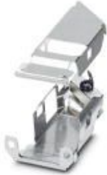
D-SUB EMC inner sleeve, for sleeve housing VS-09-..., shell size 1, shielded

Please be informed that the data shown in this PDF Document is generated from our Online Catalog. Please find the complete data in the user's documentation. Our General Terms of Use for Downloads are valid ( http://phoenixcontact.com/download )