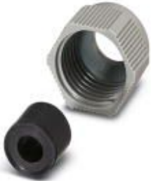
D-SUB cap nut with line seal, for conductor diameter of 5 mm ... 10 mm, for sleeve housing VS-15-...

Please be informed that the data shown in this PDF Document is generated from our Online Catalog. Please find the complete data in the user's documentation. Our General Terms of Use for Downloads are valid ( http://phoenixcontact.com/download )