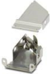
D-SUB EMC inner sleeve, shell size 2, shielded, for sleeve housing VS-15-...

Please be informed that the data shown in this PDF Document is generated from our Online Catalog. Please find the complete data in the user's documentation. Our General Terms of Use for Downloads are valid ( http://phoenixcontact.com/download )