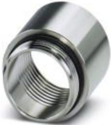
NPT adapter, IP68, up to 5 bar, incl. O-ring seal, M32 to 1"

Please be informed that the data shown in this PDF Document is generated from our Online Catalog. Please find the complete data in the user's documentation. Our General Terms of Use for Downloads are valid ( http://phoenixcontact.com/download )