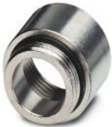
NPT adapter, IP68, up to 5 bar, incl. O-ring seal, M25 to 3/4"

Please be informed that the data shown in this PDF Document is generated from our Online Catalog. Please find the complete data in the user's documentation. Our General Terms of Use for Downloads are valid ( http://phoenixcontact.com/download )