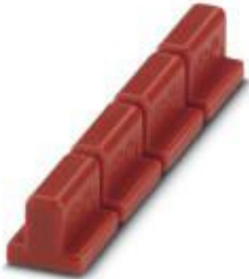
Coding profile, 4 coding profiles per strip, for insertion in coding keyways

Please be informed that the data shown in this PDF Document is generated from our Online Catalog. Please find the complete data in the user's documentation. Our General Terms of Use for Downloads are valid ( http://phoenixcontact.com/download )