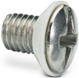
Sealing screw, size: Countersunk head, IP67, replacement part for D7 size HEAVYCON housing

Please be informed that the data shown in this PDF Document is generated from our Online Catalog. Please find the complete data in the user's documentation. Our General Terms of Use for Downloads are valid ( http://phoenixcontact.com/download )