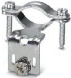
Strain relief clamps contact inserts of series: B-, BB-, D 40, D 64, DD and HV, lateral cable exit

Please be informed that the data shown in this PDF Document is generated from our Online Catalog. Please find the complete data in the user's documentation. Our General Terms of Use for Downloads are valid ( http://phoenixcontact.com/download )