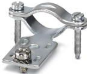
Strain relief clamps contact inserts of series: B-, BB-, D 40, D 64, DD and HV, straight cable exit

Please be informed that the data shown in this PDF Document is generated from our Online Catalog. Please find the complete data in the user's documentation. Our General Terms of Use for Downloads are valid ( http://phoenixcontact.com/download )