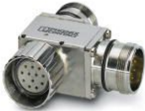
M23 T-distributor, 12-pos., with one M23 socket and two M23 plugs; position 9 and 10 bridged

Please be informed that the data shown in this PDF Document is generated from our Online Catalog. Please find the complete data in the user's documentation. Our General Terms of Use for Downloads are valid ( http://phoenixcontact.com/download )