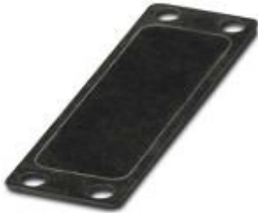
Replacement flange seal, for HEAVYCON panel mounting base type D25, self-adhesive, color: Black

Please be informed that the data shown in this PDF Document is generated from our Online Catalog. Please find the complete data in the user's documentation. Our General Terms of Use for Downloads are valid ( http://phoenixcontact.com/download )