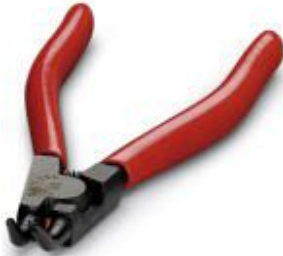
Contact removal tool for HC-M-EMV contact carriers

Please be informed that the data shown in this PDF Document is generated from our Online Catalog. Please find the complete data in the user's documentation. Our General Terms of Use for Downloads are valid ( http://phoenixcontact.com/download )