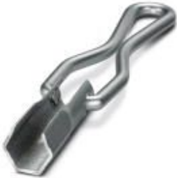
Socket wrench, for tightening and unscrewing the QUICKON union nut, wrench size 19 mm

Please be informed that the data shown in this PDF Document is generated from our Online Catalog. Please find the complete data in the user's documentation. Our General Terms of Use for Downloads are valid ( http://phoenixcontact.com/download )